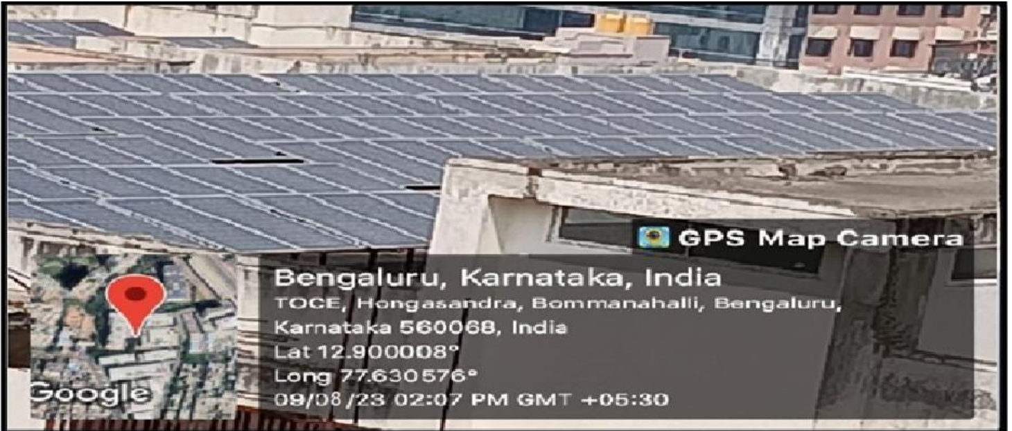
Overview of Solar Panel

E-mail: engprincipal@theoxford.edu Web: www.theoxfordengg.org